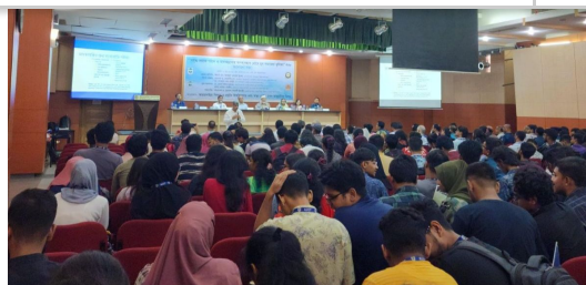
Seminar on Youth Participation in Substance Use Prevention