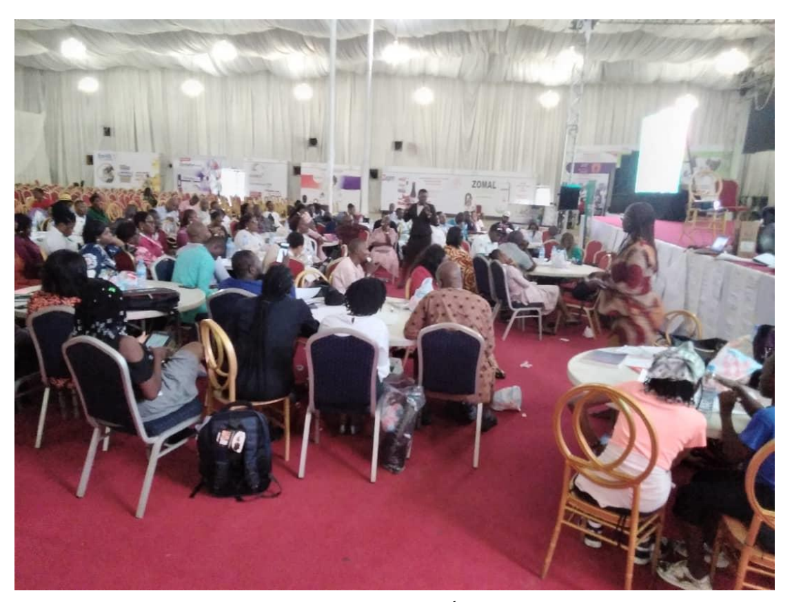
The Dome Event Centre, venue of the 42<sup>nd</sup> Annual National Scientific conference of ACPN was first used to assemble registered participants on arrival before moving to Troscana Hotel for subsequent training sessions.

To get this impressive number of 95, the Association leverage on few factors such as conducting the training during our Annual National conference where at least a thousand Community Pharmacists would gather; making the training also attract Pharmacists Council of Nigeria's Mandatory Continuous Professional Development Points and by reducing the cost of training by over 50% of conventional rates.