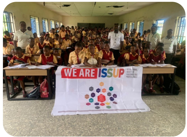
Government Secondary School Henshaw Town