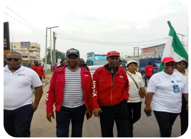
Kaduna State ISSUP Coordinator, The Kaduna State NDLEA Commander, The Director of Narcotics, KD State, The Secretary General & Kaduna State ISSUP Secretary and some Members of ISSUP, Kaduna on Road walk in Commemoration of International Day against Drug Abuse