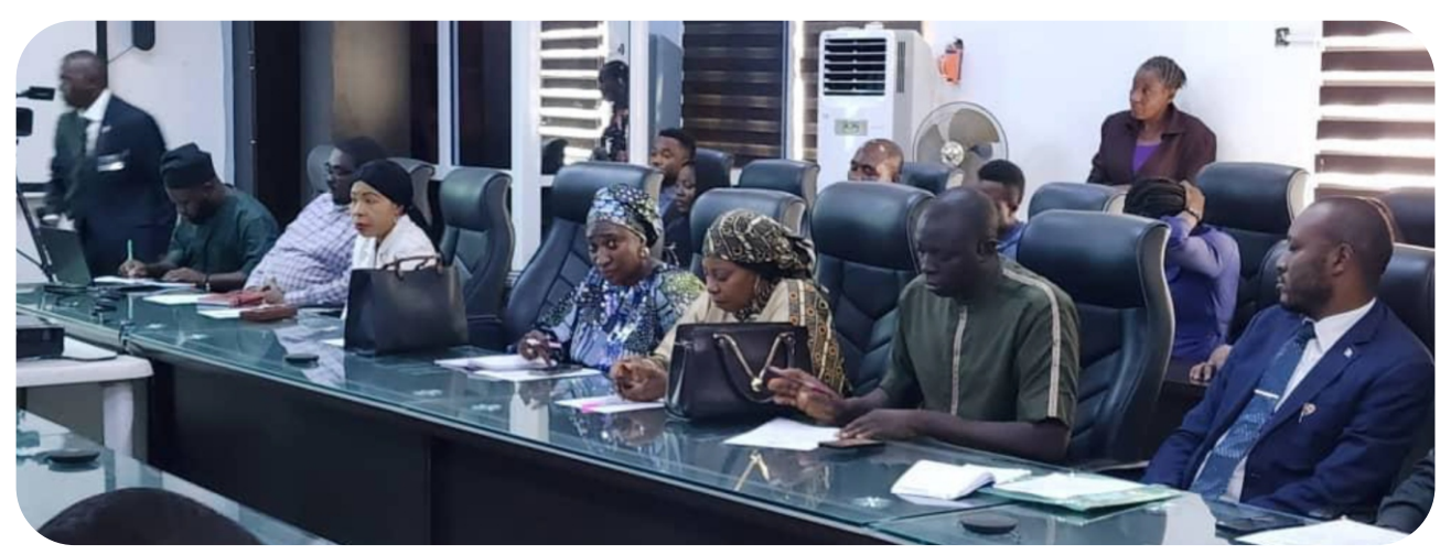
At the Federal Ministry of Health press briefing