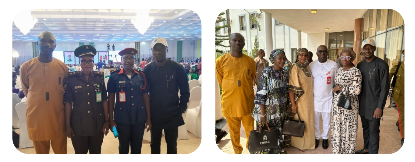
ISSUP, NDLEA and NSCDC officers at the state House Conference Center Abuja