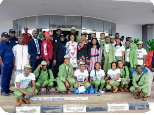
Some of the participants at the grand finale